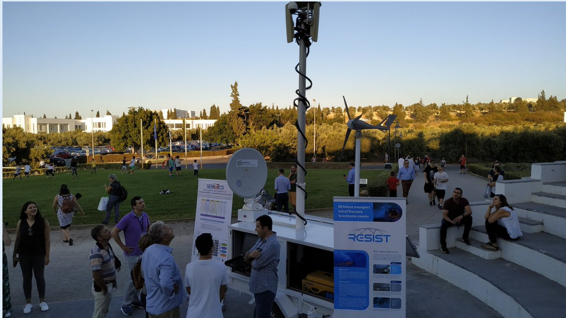
SEMIoTICS' Mobile communication infrastructure demonstration at Researchers Night at Crete, September 2019.